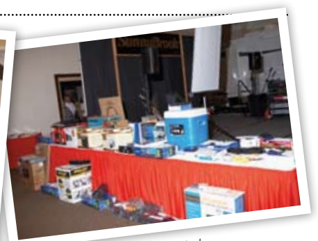
Door prizes for all who attended